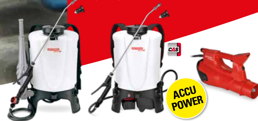
Backpack sprayer RPD 15*