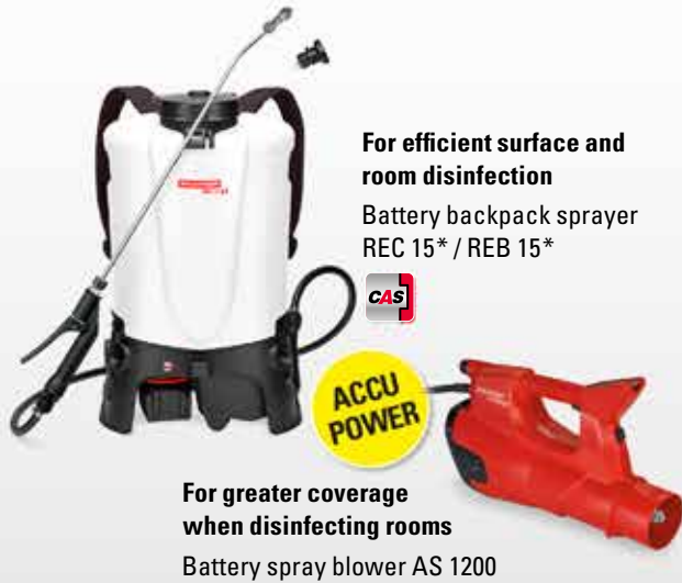
For efficient surface and room disinfection Battery backpack sprayer REC 15* / REB 15*

From trigger sprayers to backpack sprayers with batteries and additional spray blower – we are the experts when it comes to efficient, effortless room and surface disinfection.