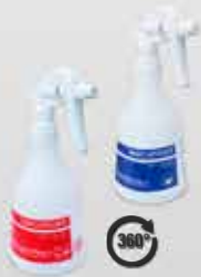
For disinfecting surfaces quickly by spraying and wiping Trigger sprayer McProper P/E and Desinfecta+