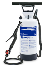
Foam-Matic 5 E (Blue = Alkaline foaming agents) Art.No. 11907601